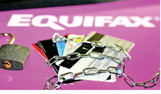
cent, at $113.12 on Monday. It has fallen 20.7 percent in the two trading days since the Sept. 7 disclosure of the breach, reducing Equifax's market value by more than $3.5 billion.

Equifax's share price closed down $10.11, or 8.2 per-