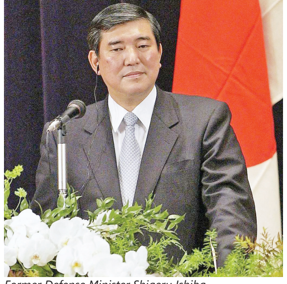
Former Defense Minister Shigeru Ishiba

What is really needed is cool-headed debate that is