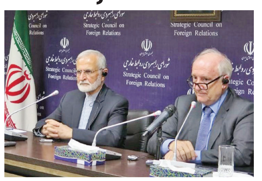
Kamal Kharrazi and former French foreign minister Ubert Vedrine (R) speaking at a meeting of the Strategic Council on Foreign Relations.

France's decision to sign the statement that has killed 13,000 Iranians.